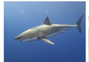
Great White Shark